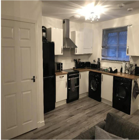
Open Plan Kitchen